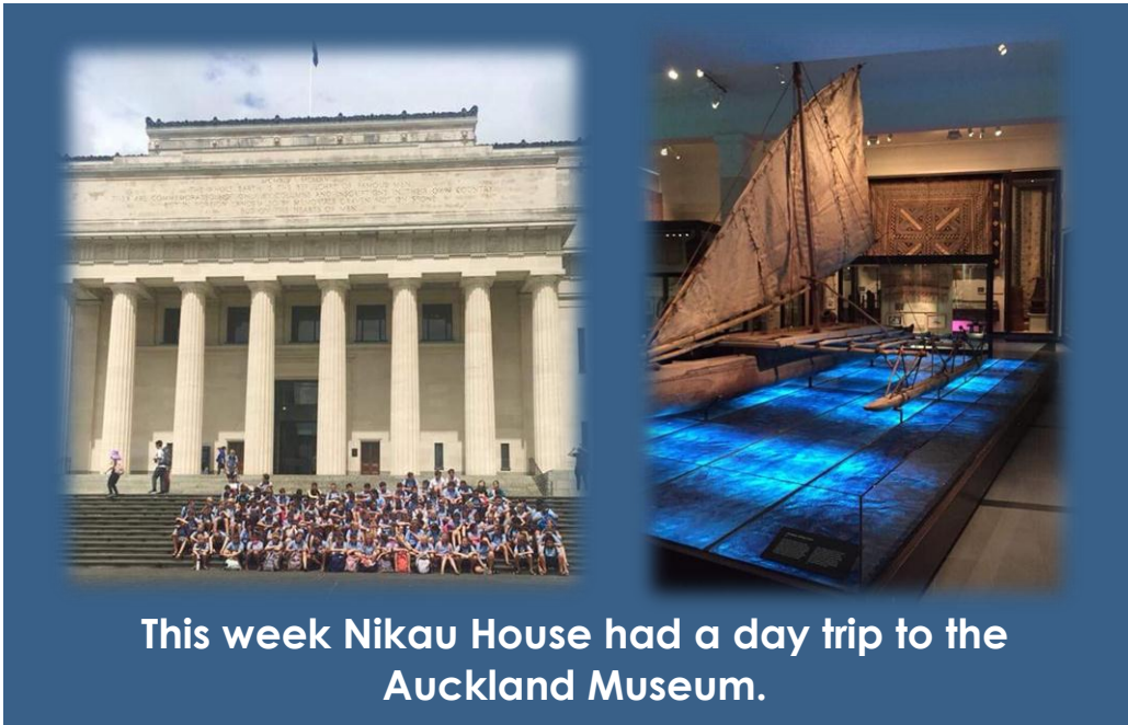
This week Nikau House had a day trip to the Auckland Museum.